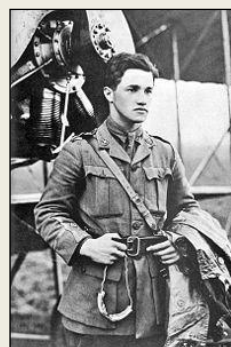
Albert Ball - Nottingham's WW1 Ace Pilot