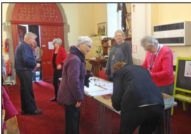
MEETERS & GREETERS who greet members and visitors as they come into the meeting and encourage them to sign in