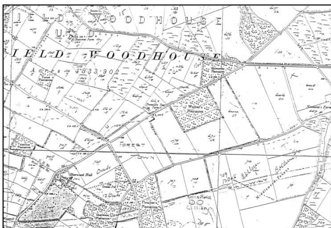
OS Map Second Edition 1900 Sheet No XXIII.SW Scale 6" to One Mile

Pauline hastily sorted out some files on Forest Town and also brought along a selection of maps for us to look at instead, plus several updated copies of the A-Z of Forest Town that we have been working on in previous months, this is really growing now.