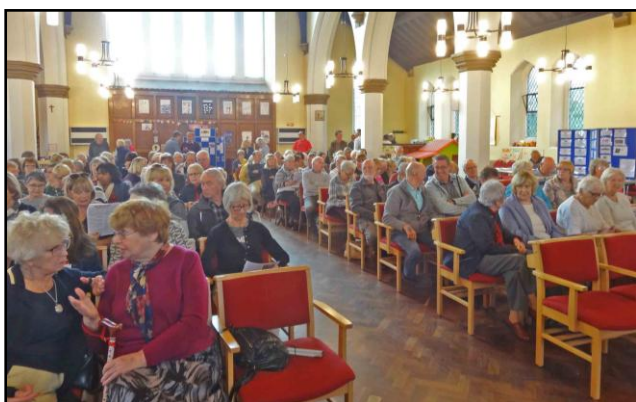
Waiting for the meeting to start, There is always a good buzz once people start to arrive and the seats fill up very quickly.

A SMILE IS WORTH A THOUSAND WORDS That is why we give Smiley Badges to visitors