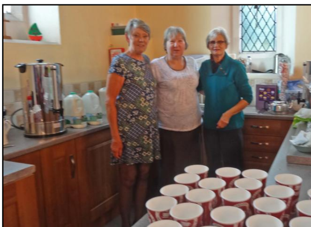
Three TEA LADIES who are just part of a large team. There is a rota system to ensure they are not working every month.