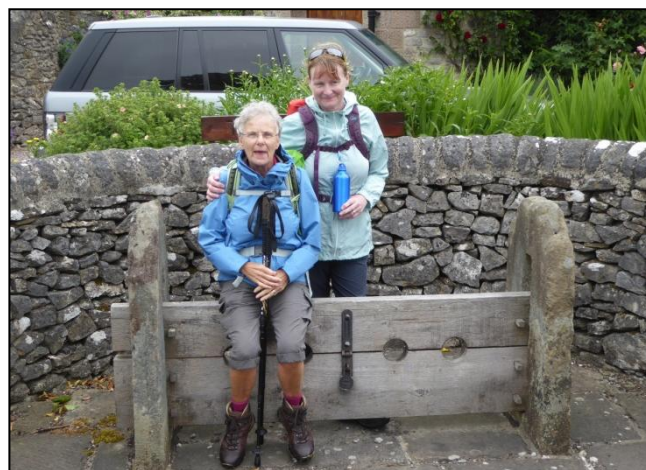
Village Stocks Little Longstone

On reaching Housley, we made our way back through fields of livestock with countless stiles to negotiate and distant views to enjoy.