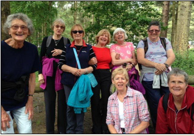
A happy group on a short walk