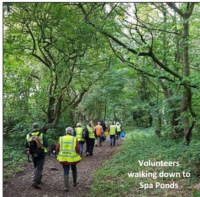
Volunteers walking down to Spa Ponds

There were many interesting photographs for us to look at and it was also interesting to learn of the conservation work all the volunteers are doing. They have regular work sessions and anyone is welcome to join them.