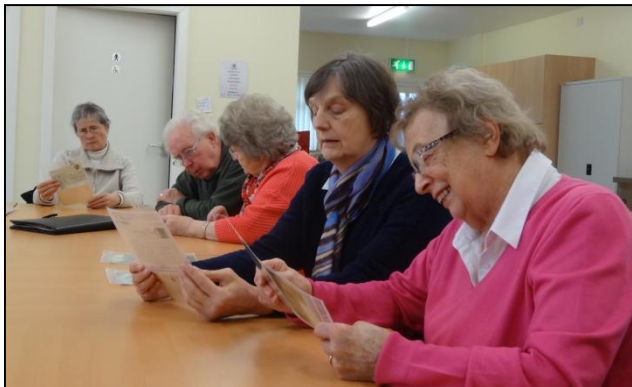
Studying post cards