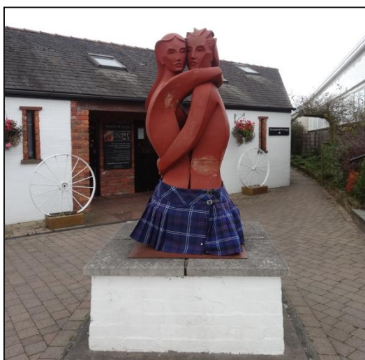
You might see the couple at Gretna Green.