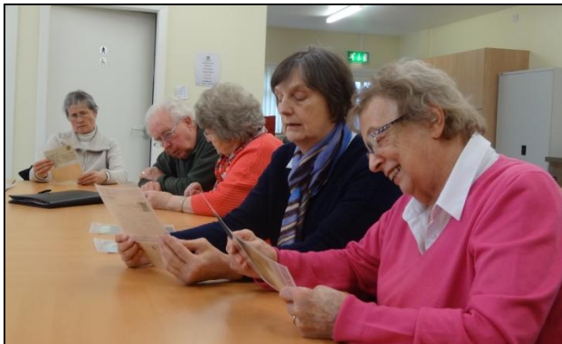
Studying post cards