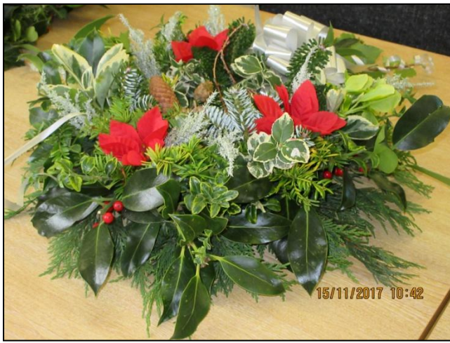
Christmas wreath made at the gardening group