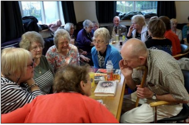
"I know the answer"

The December meeting is our Xmas Fuddle so we are having an extra hour and finishing at 5p.m. Hope you will be in good voice as there will be quite a bit of skiffle which everyone will know the words to.