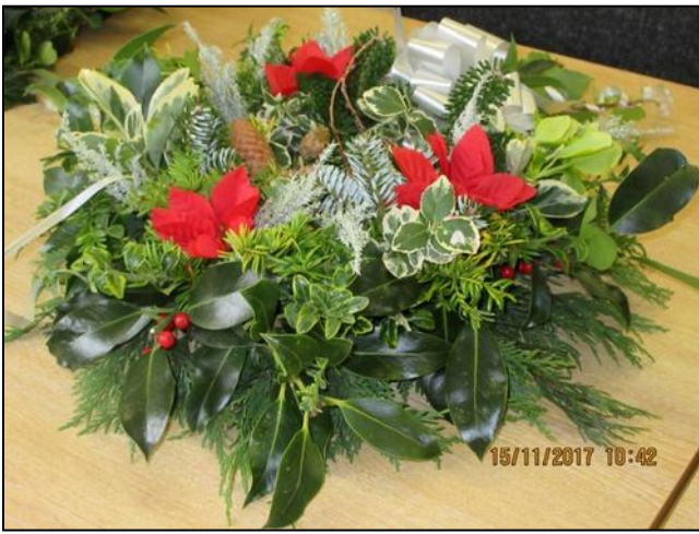
Christmas wreath made at the gardening group