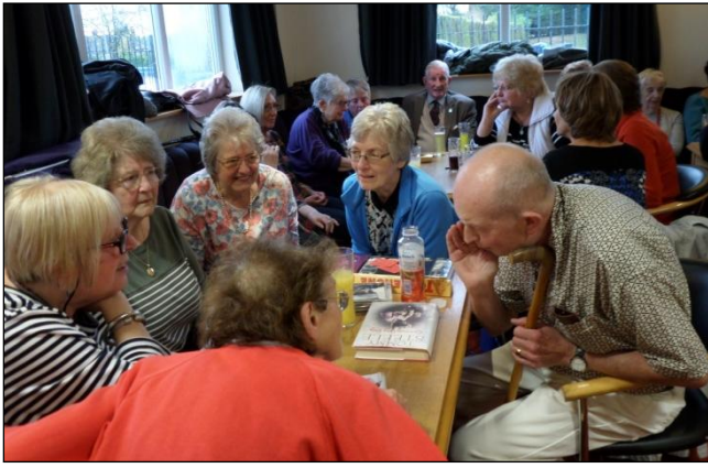
"I know the answer"

The December meeting is our Xmas Fuddle so we are having an extra hour and finishing at 5p.m. Hope you will be in good voice as there will be quite a bit of skiffle which everyone will know the words to.