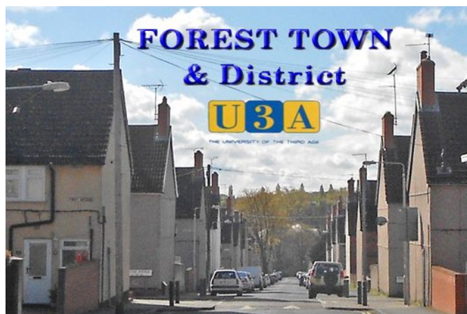
The Avenues today