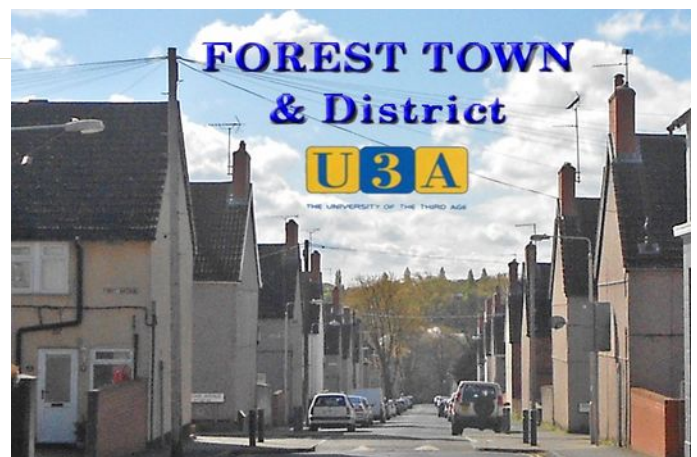
The Avenues today