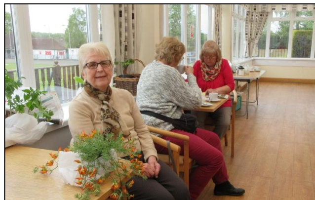
Group Member in the Arena Conservatory

There was plenty of time for a friendly chat, and we discussed Gardening Things (how to grow wisteria; the best way to deal with our local sandy soil), and Not Gardening Things (looking after grandchildren - and unusual pets!).