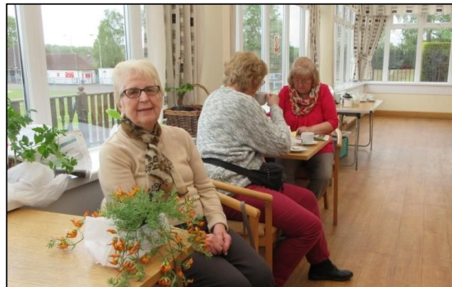
Group Member in the Arena Conservatory

There was plenty of time for a friendly chat, and we discussed Gardening Things (how to grow wisteria; the best way to deal with our local sandy soil), and Not Gardening Things (looking after grandchildren - and unusual pets!).