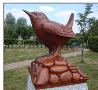
Memorial to Women's Royal Naval Service

For lovers of nature there are so many wonderful plants and trees or a walk by the river. There is something for everyone at the National Arboretum.