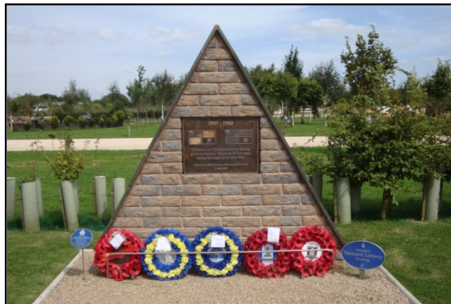
Commemorating the thousands of Volunteers who gave service in the height of the Cold War

The first thing we would recommend when visiting the National Arboretum at Alrewas, not far from Lichfield, is to wear comfortable flat shoes as you can do a little or as much walking as you want to do. We have been a few times and never managed to get round everything as there are so many different memorials to see, and new ones keep being added.