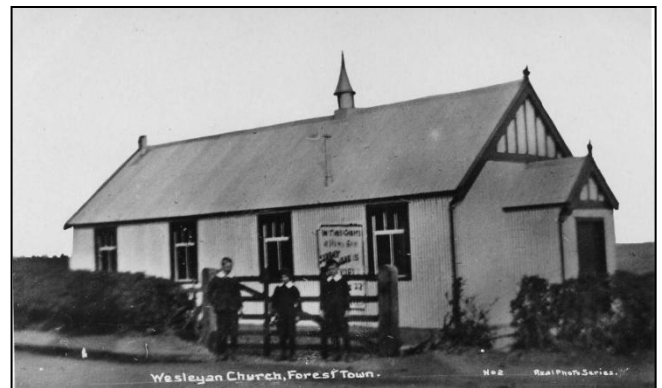
Wesleyan Methodist Church Forest Town

We continued into Forest Town looking at the views both inside and out of St Alban's and the Catholic Church, as well as the churches building that are no longer there.