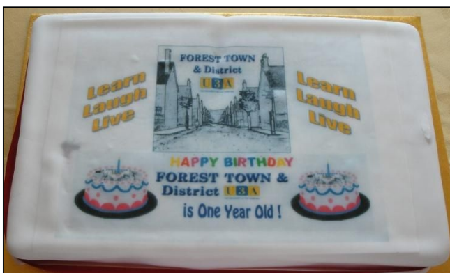
Close up of one of the cakes

Around the room were displays by various groups Family History, Local History, Play Reading and Crafts. It was amazing to see just how many things the craft group had on display, they are evidently a very active and talented group. Members of the play reading group added colour to the day by dressing up in character parts.