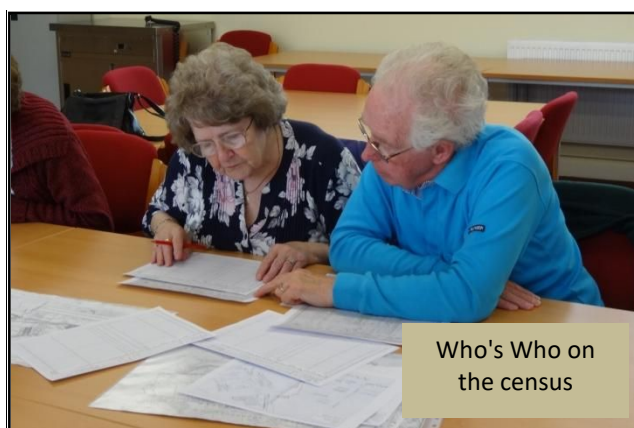
Who's Who on the census

It was then time to find out who some of the occupants of Sherwood Hall were by looking at the 1851 and 1901 census. Transcribing copies of these to discover the names and occupations was soon being undertaken and everyone had to be encouraged to take a refreshment break.