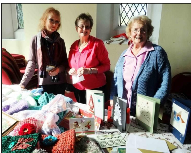
Craft Group ladies with some of their display at the October birthday Meeting,