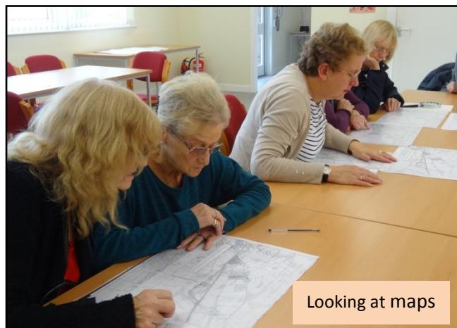
Looking at maps

It was a hands on session and a series of old maps proved to be of great interest to everyone as they discovered how the area developed over the years.