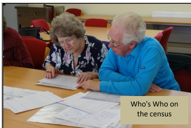
Who's Who on the census

It was then time to find out who some of the occupants of Sherwood Hall were by looking at the 1851 and 1901 census. Transcribing copies of these to discover the names and occupations was soon being undertaken and everyone had to be encouraged to take a refreshment break.