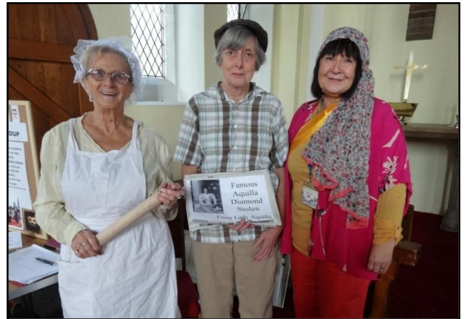
Members of the Play Reading Group at the October Birthday Meeting

4 th Tuesday 1pm - 2.30pm Meet Sherwood Room Forest Town Arena,