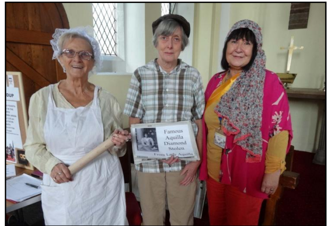
Members of the Play Reading Group at the October Birthday Meeting