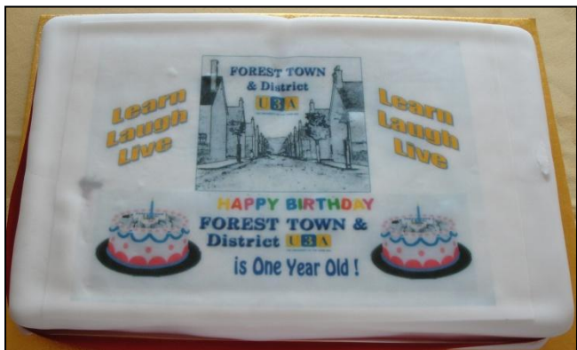
Close up of one of the cakes

Around the room were displays by various groups Family History, Local History, Play Reading and Crafts. It was amazing to see just how many things the craft group had on display, they are evidently a very active and talented group. Members of the play reading group added colour to the day by dressing up in character parts.