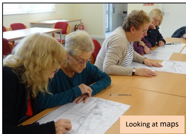
Looking at maps

It was a hands on session and a series of old maps proved to be of great interest to everyone as they discovered how the area developed over the years.