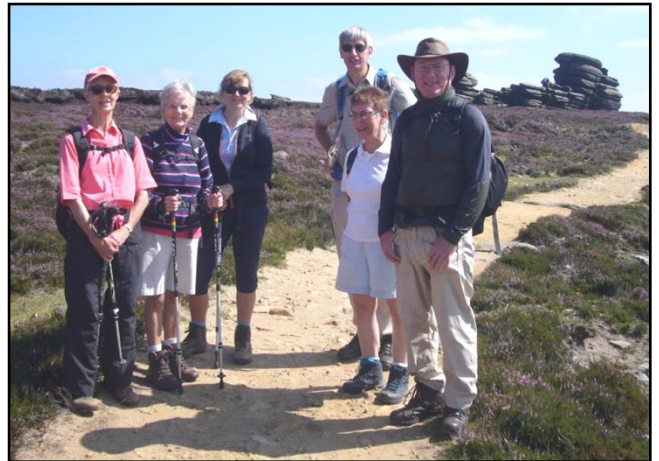
Derwent Edges with Wheel Stones behind the people, on the 17 th August.