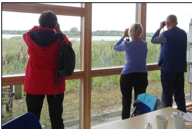
Viewing birds from the visitor centre.

Next month we are revisiting the reserve at the old Pleasley pit, meeting there at 10am. Kathleen