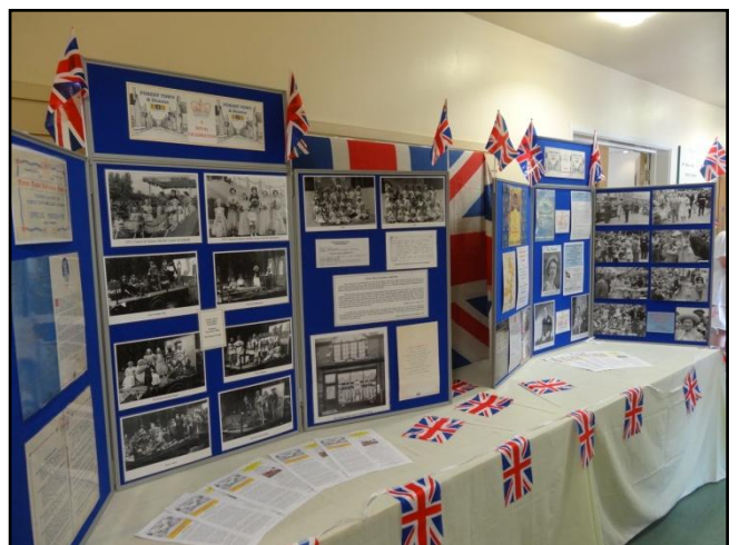
The local history display of how Forest Town celebrated the coronation.

The display was on show at our June Meeting and was then our contribution to the Royal Revelry event. Since then it has been in Forest Town Library.