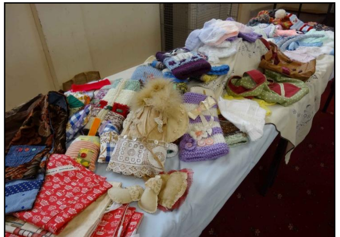
A wonderful display by the Craft Group showing a wide variety of work.