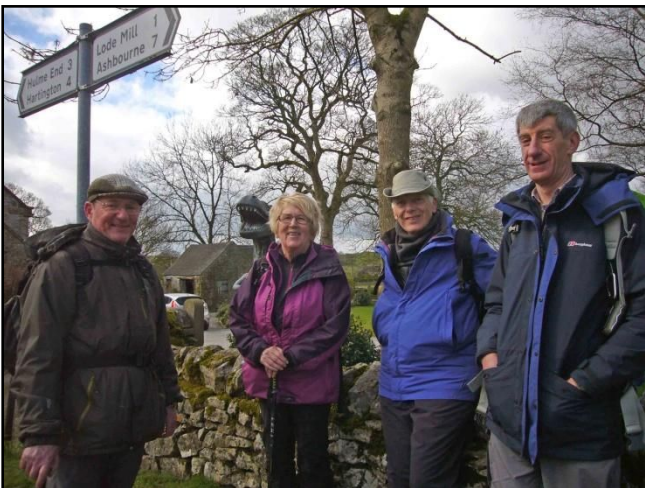
Sometimes strangers wish to join the group!

We continued through Narrow Dale then on into Alstonefield, where we did a circuit of the village to admire the cottages and gardens and, finding the George Inn open, quickly returned for drinks/cuppas. Another really enjoyable day.