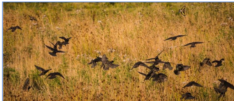
Starlings and goldfinches

In total 50 different species of bird were recorded during the trip.