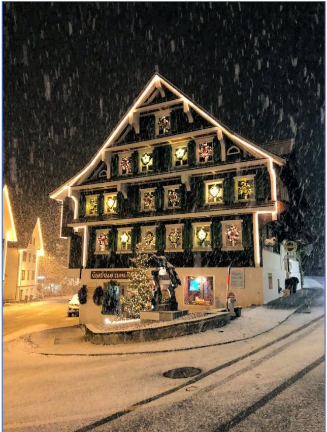
House in Switzerland