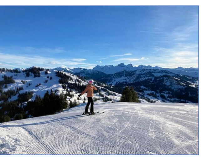
Skiiing in Switzerland