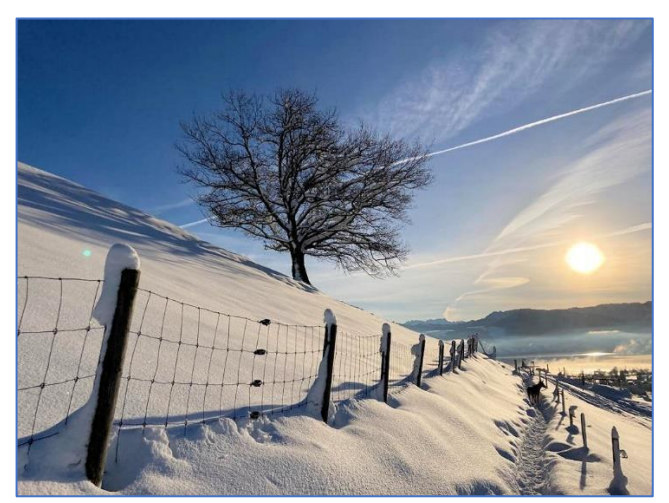
Sunset in Switzerland