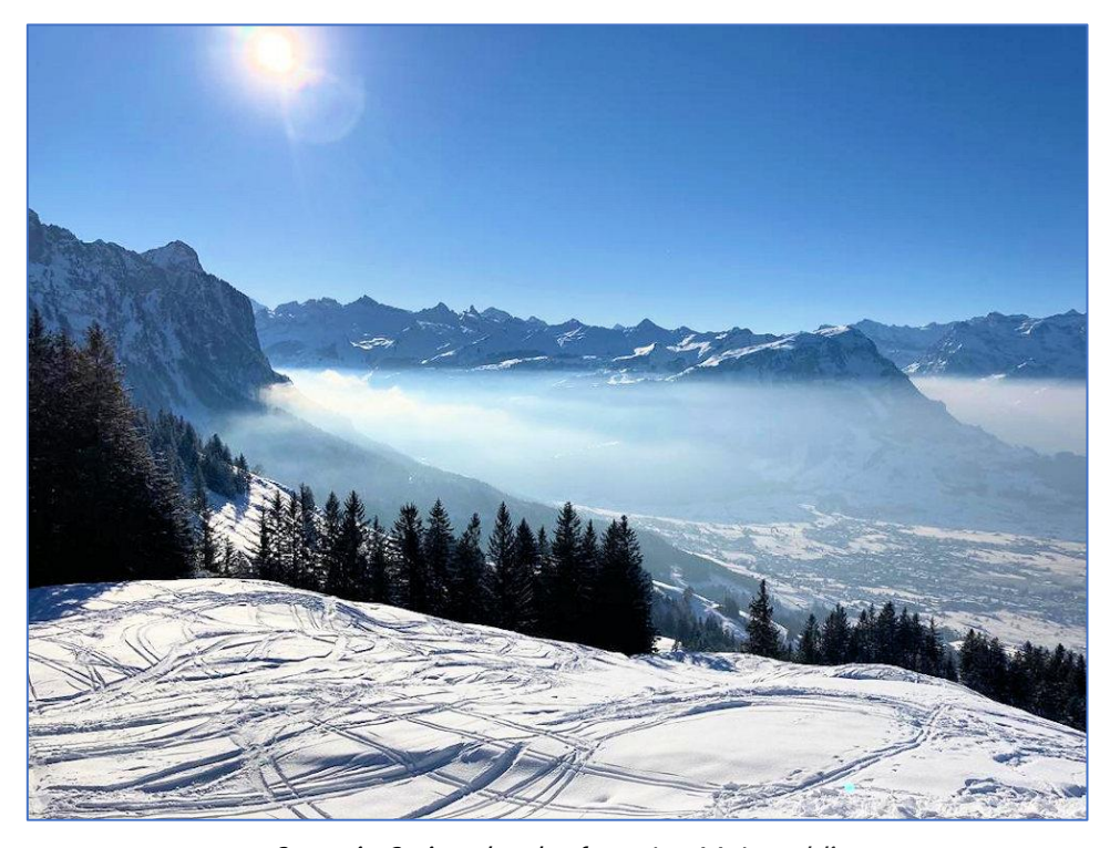
Snow in Switzerland

This is a reminder that draw tickets for the wonderful 10th anniversary quilt created by our u3a Quilting for Fun Group are available for purchase at our monthly meetings. This is in aid of raising funds for improved accessibility for u3a members. So please bring some money with you to our next monthly meeting in Exmouth Pavilion on 8 December so that you can have the chance of winning this magnificent quilt.