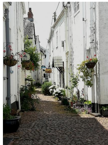
Whilst out and about locally, I passed this historic street, but where? - Dave Hole