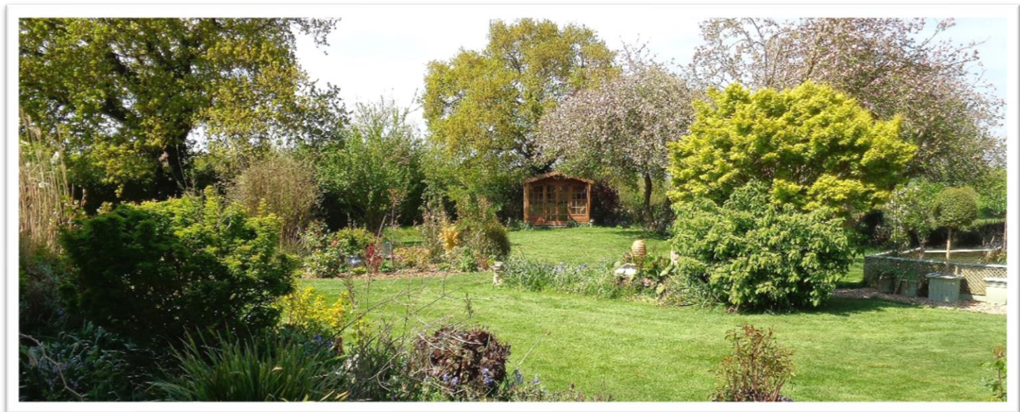
A Woodbury Garden During Apple Blossom 'Lockdown' Time – April 2020