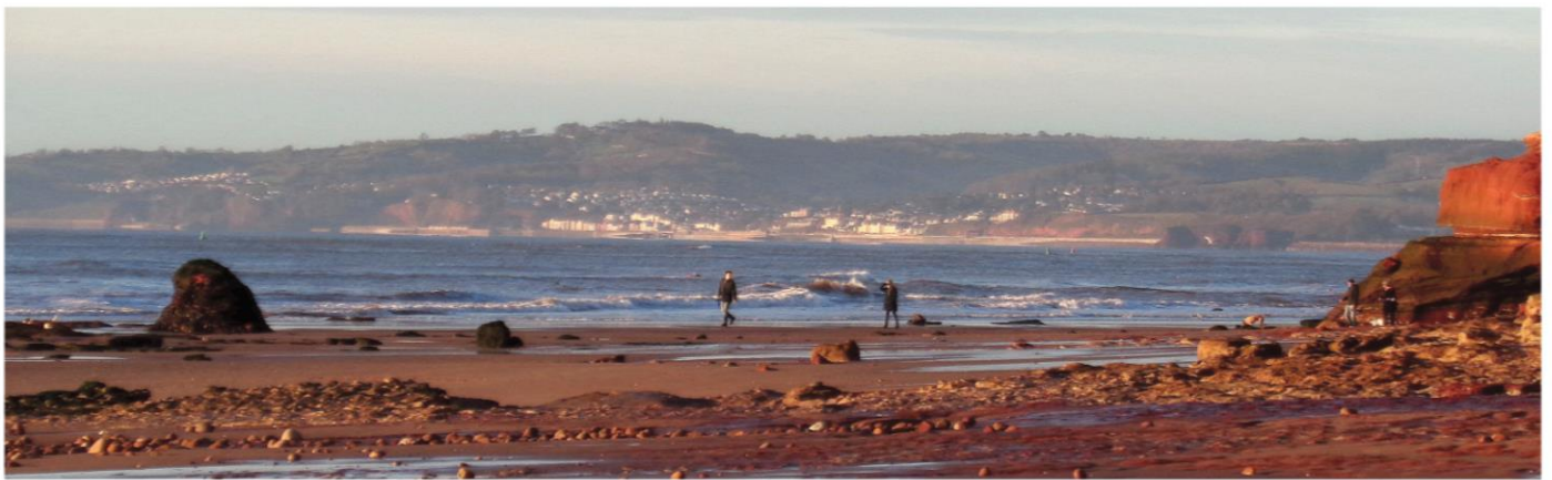
Above: Looking across to Dawlish from the beach below the Geoneedle nr. Orcombe Point 25 th Dec 2019