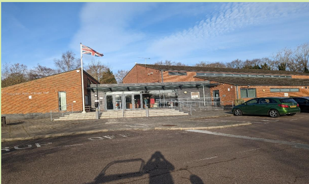
Theydon Bois Village Hall

Refreshments were served throughout the morning and members of the EFu3a Executive Committee were on hand to provide further information about our charity and its activities.