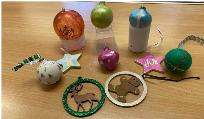
Christmas baubles decorated by the craft group