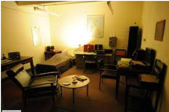
Prime Minister's room

Living conditions in the bunker were spartan. A separate bedsitter was provided for the Prime Minister with two smaller rooms for senior ministers. 'Hot-bedding' in dormitory accommodation was the norm for other members of this community which could have numbered around 600, with beds only inches apart and very little space for personal belongings.