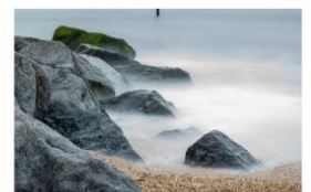
Haying - slow shutter speed