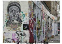
Brick Lane London