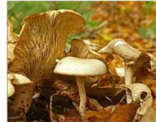
Queen Elizabeth Country Park