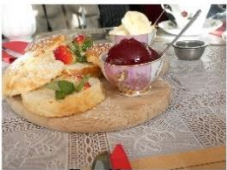
4 Teas Havant