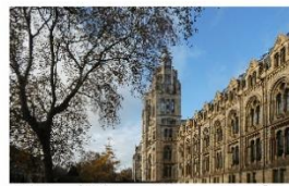
Natural History Museum London