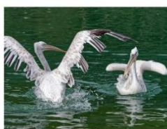
Arundel Wetlands centre