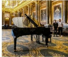
Open House London