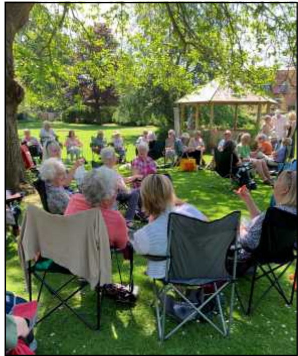
Picnic in the park at Buntingford.