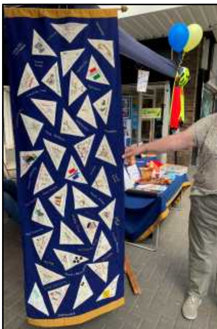
Banner of activity triangles is a different display idea from Broxbourne.