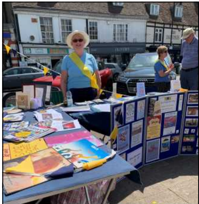
Above ... information stand at Lea Valley. Below ... litter pickers at Witham and District.

Meanwhile the trust is holding a series of online review and feedback sessions ,, before a late summer survey ... to gauge when to hold its planned second u3a day next year.