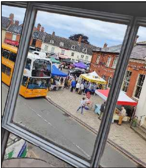
Aylsham U3A market stall from across the street.