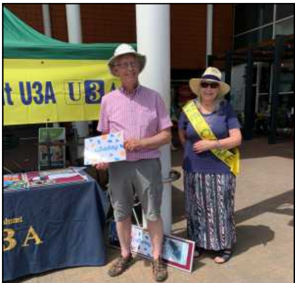
Enjoying the sun at Cheshunt's info stand.