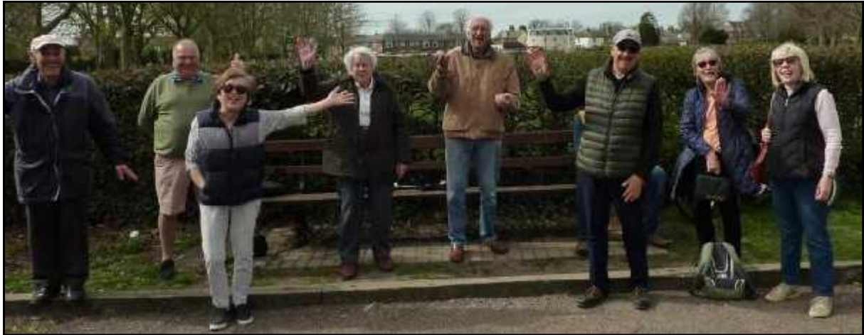
Maldon u3a petanque group all set to get playing after the pandemic