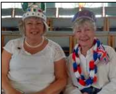
Great Yarmouth U3A