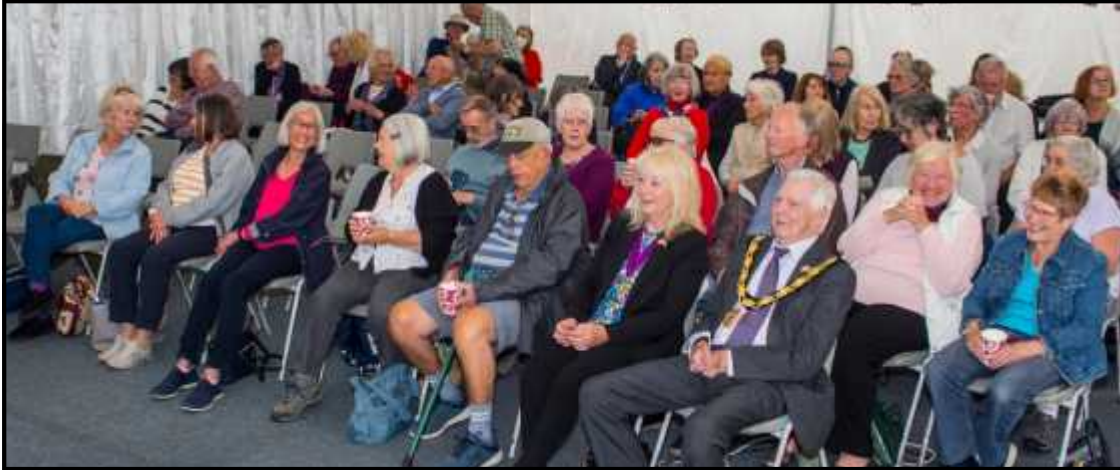
All set for a talk about 70 royal years.