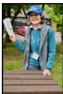
Photo round-up from the special afternoon marking two major milestones