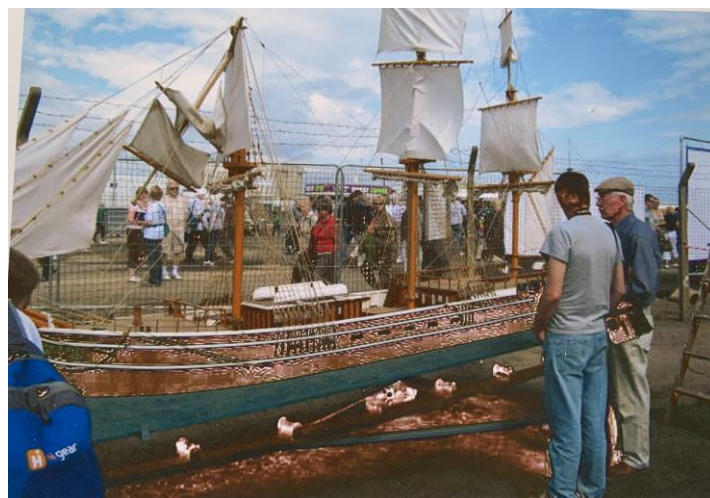
Taking the helm (left) and admiring the workmanship (right) at Hartlepool Tall Ships, 2010

Below: Celebrating 20 years of Durham u3a with buffet, games and, of course, cake! (There was another cake for the 25 th anniversary)