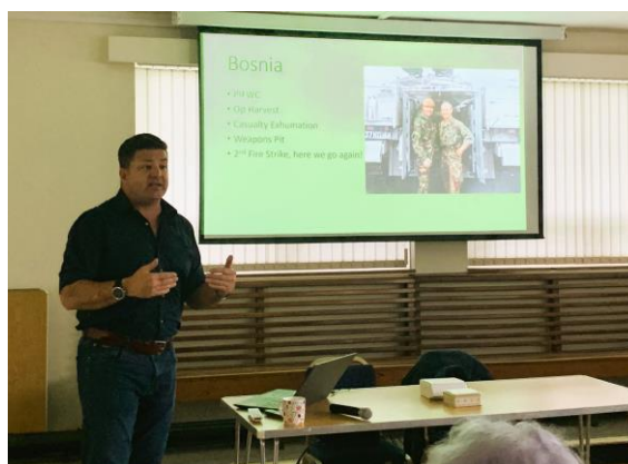
Telling us how it was in Bosnia

On a lighter note, laugh-out-loud moments included his accounts of using a bread van to smuggle Kate Middleton's wedding dress into a hotel on the eve of the ceremony to avoid the press, and being dropped into a Trooping the Colour