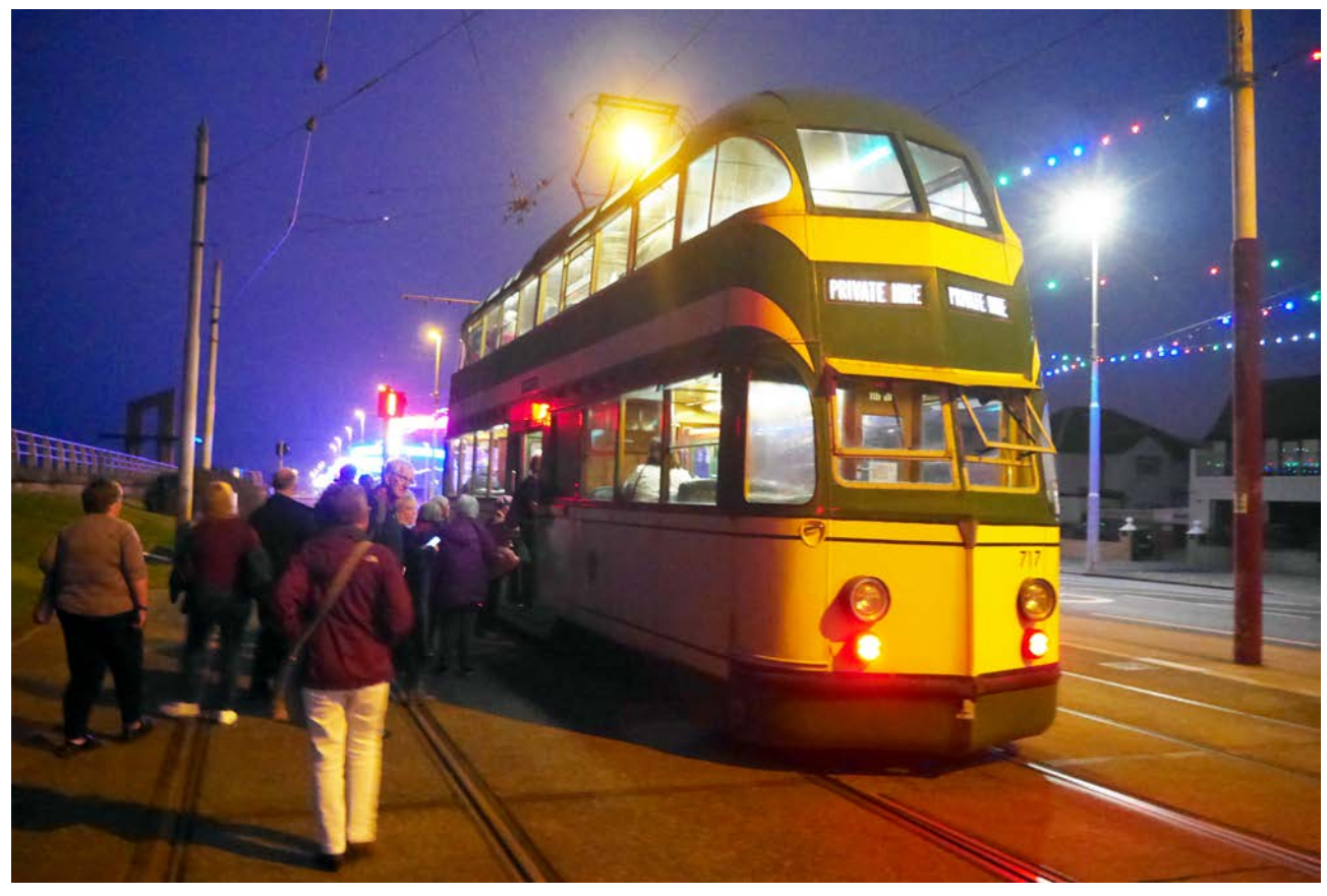
Blackpool's Heritage Tram

Dumfries u3a committee member Clive Brown reports on a recent trip to Blackpool illuminations with Stewartry u3a: