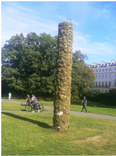
Model for Moss Column (2023)