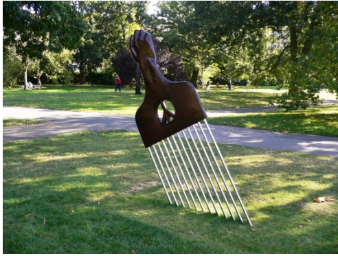
All Power to All People (2017)