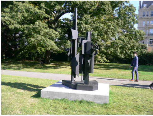
Model for Celebration II (1976)