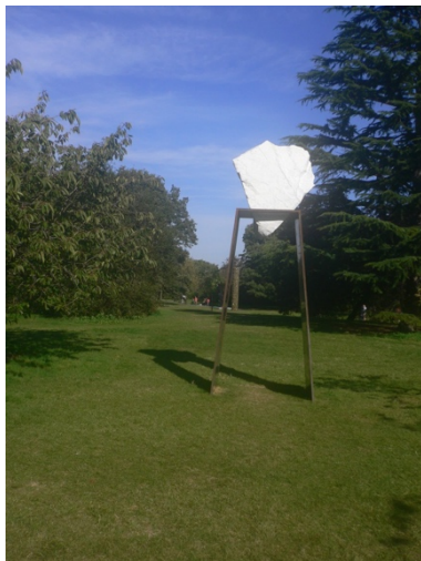
Waking Matter (2023)