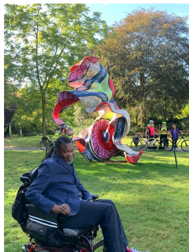
Material (SG) IV (2023)