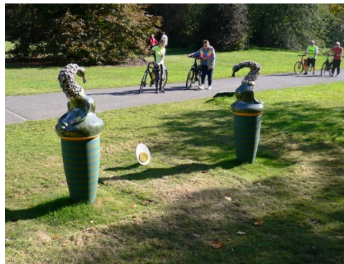
The Debate (2023)