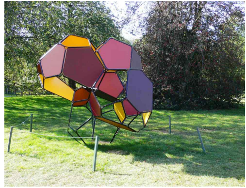
Silent Autumn (2023)