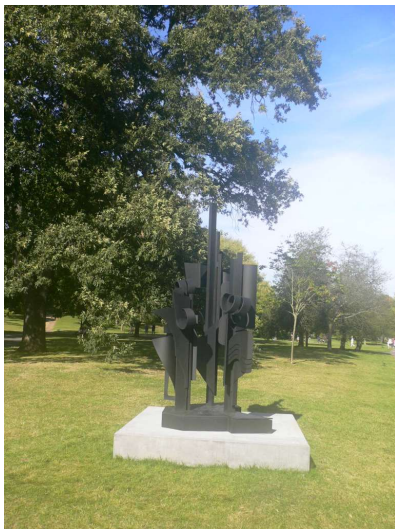
Model for Celebration II 1976