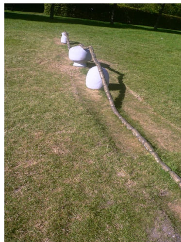
You will carry dreams, memories, and new beginnings (48 Days) (2023)