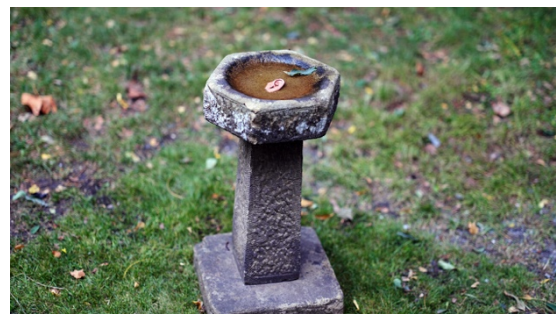
Unfolding Silence (2023)