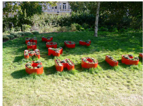
My Body My Choice (2022)