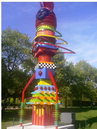
The Mothership Connection (2021)