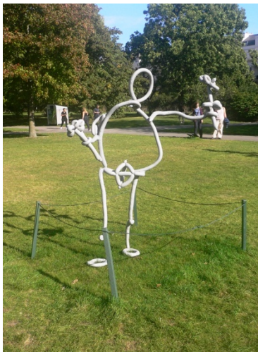
Fat man with flowers 2 (2022)