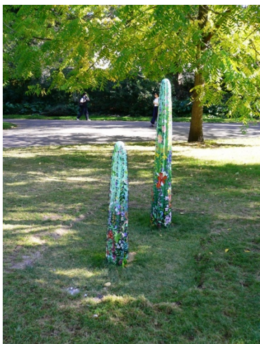
Garden of Unearthly delights.