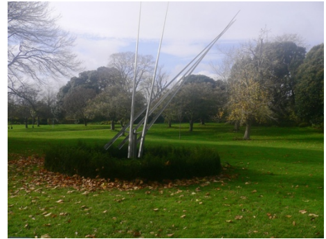
Five lines in parallel planes