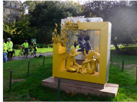
Sim and the yellow glass birds