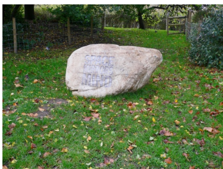
Space mirrors mind