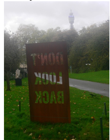
Don't look back