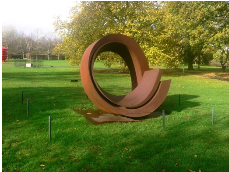
Curvae in curvae