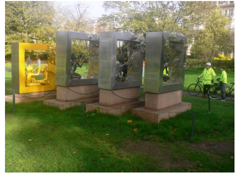
Sim and the yellow glass birds