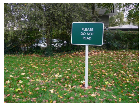
10 signs for the park