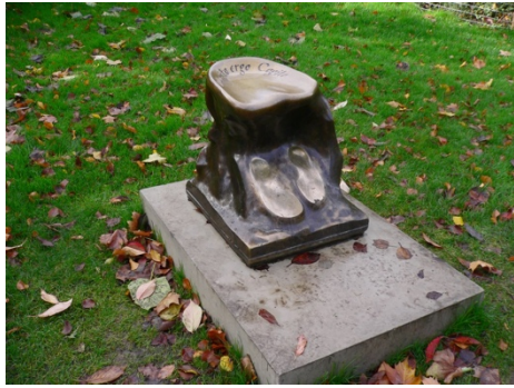
Dubito ergo cognito