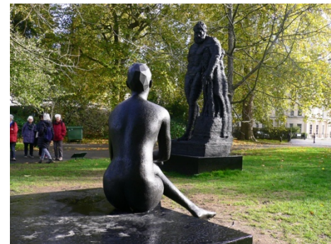
Hercules meets Galatea

The first of these was " Hercules meet Galatea ". We continued on through the gardens to see the exhibits....and to puzzle over some of the elaborate descriptions, or perhaps interpretations, of the works.