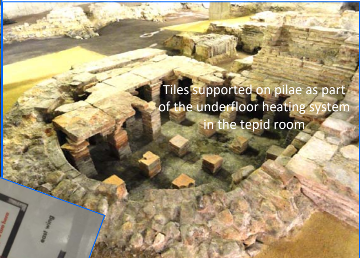
Tiles supported on pilae as part of the underfloor heating system in the tepid room