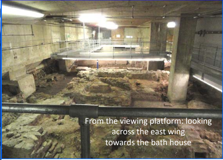
From the viewing platform: looking across the east wing towards the bath house