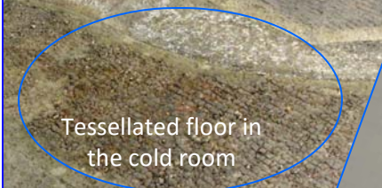
Tessellated floor in the cold room