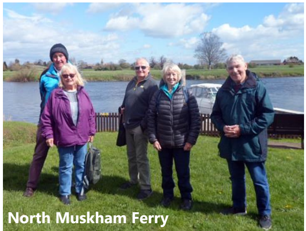
North Muskham Ferry