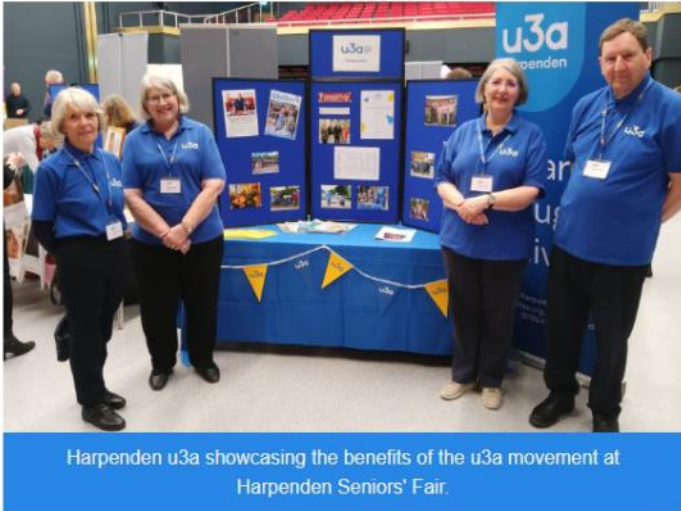
Harpenden u3a showcasing the benefits of the u3a movement at Harpenden Seniors' Fair.