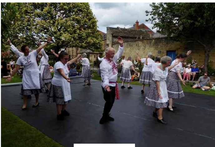
The Horo Dance Group

Some of our members joined with Matlock U3A dance group, and Sheffield Horo, (Balkan dance group) to demonstrate dances at Bakewell Day of Dance. We danced alongside many other groups, including the 'Lizzie Dripping Clog Dancers', and 'Black Pigs Morris Dancers'!. We had lots of people, young and old, join in our dances at the end of our demo.