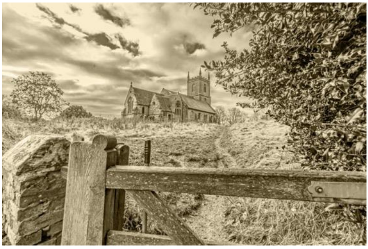
For the final visit of the year the Digital Photography Group visited Hanbury Church.

The church of St. Mary the Virgin is an Anglican Church in the village of Hanbury, Worcestershire. Its earliest parts date from about 1210 and it is a Grade 1 listed building.