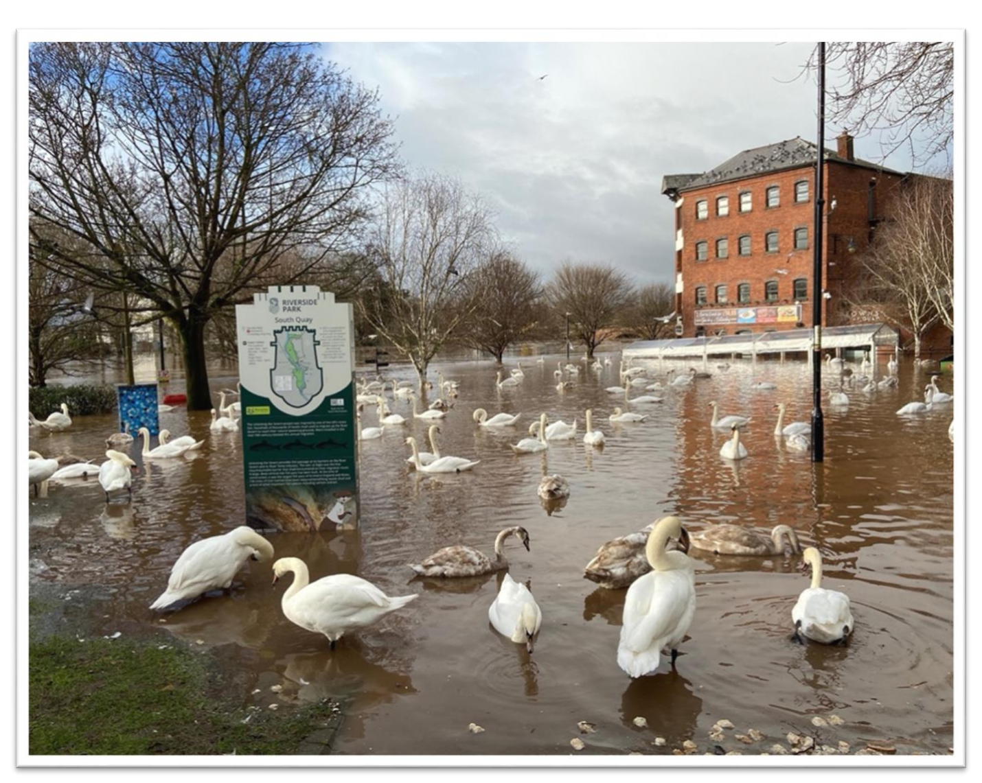
A very familiar scene!