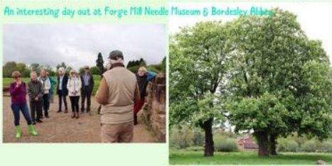
An interesting day out at Forge Mill Needle Museum & Bordesley Abbey