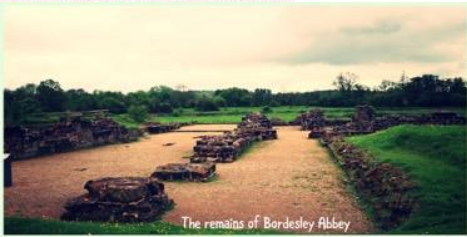
The remains of Bordesley Abbey