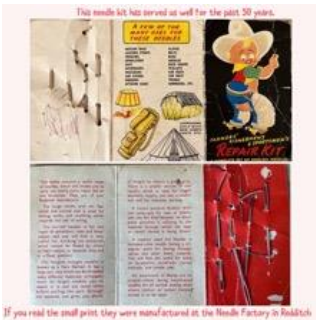
If you read the small print they were manufactured at the Needle Factory in Redditch