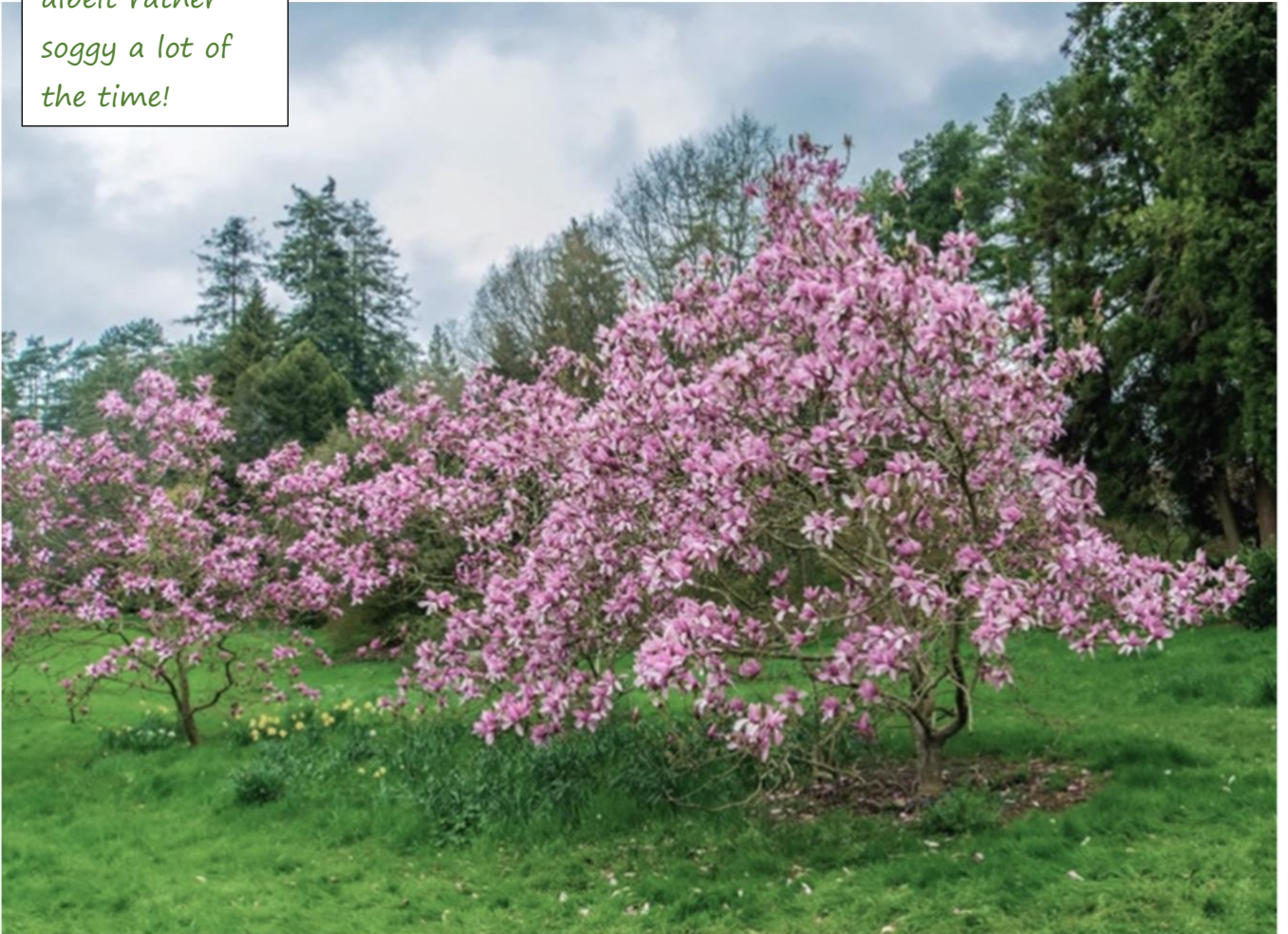
From the Visit Gardens group - taken at Batsford Arboretum (more photos further on)

Spring is here, albeit rather soggy a lot of the time!