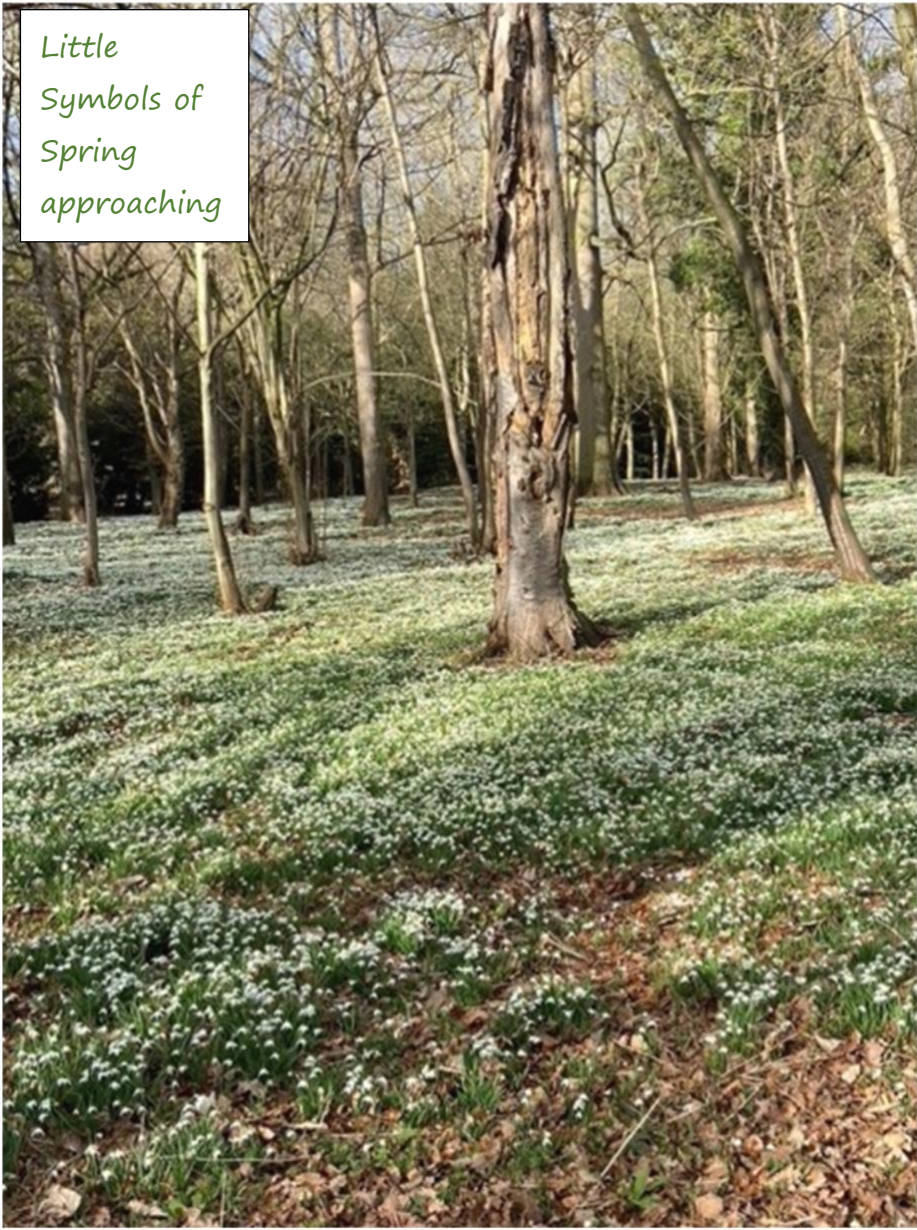
Little Symbols of Spring approaching