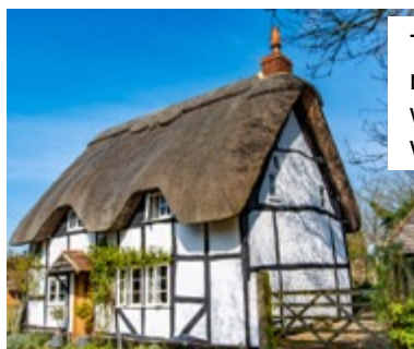
The village has a number of black & white cottages, some with thatched roofs.