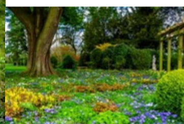
From a recent visit to Morton Hall