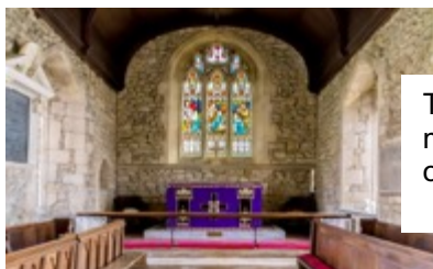
The church has two wonderful monuments in the transept; one to the Earl of Coventry