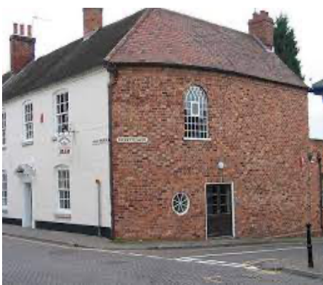
Droitwich Working Men's Club

Suitable for members who know the essentials of the game of Bridge and have at one time or another played either Rubber or Duplicate Bridge, but who may have become rusty through not playing recently and need their knowledge refreshing.