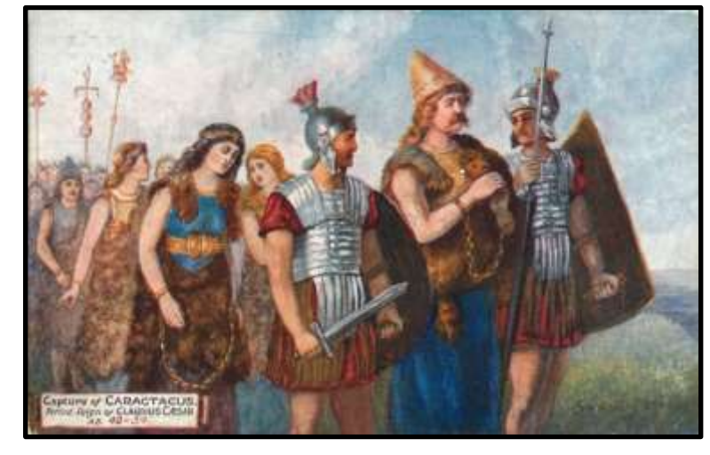
The Capture of Caractacus - illustration by Sydney Herbert