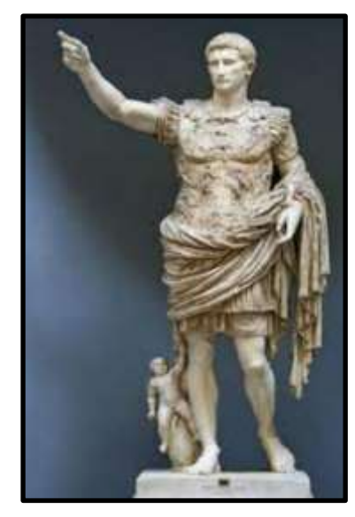
Augustus Caesar - first Roman emperor