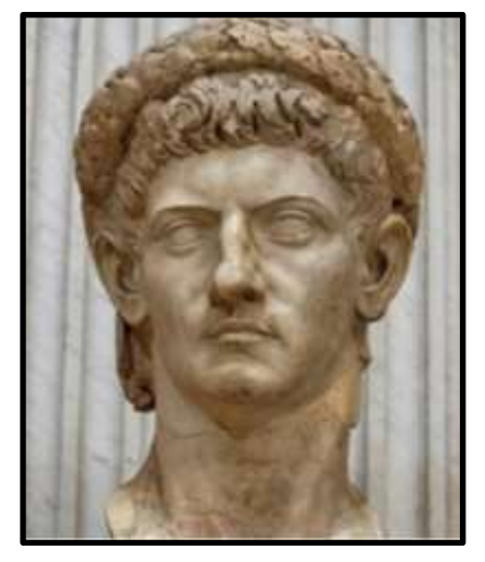
Bust of Claudius