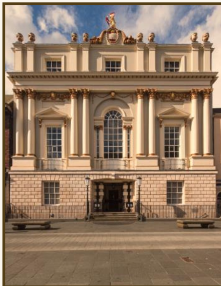
Doncaster Mansion House

(New members - please contact the Membership Secretary for a New Members form)