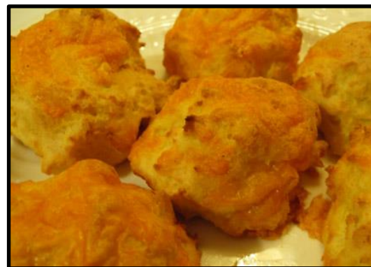
Cheese and Potato dumplings