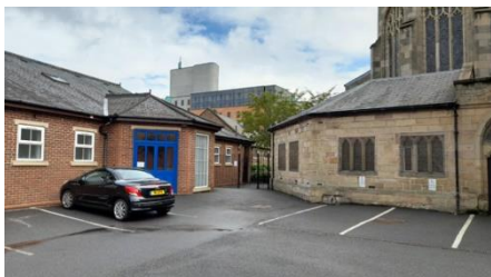
St Mary's Church Hall on the left, as seen from the car park. The back of the church is on the right.