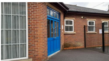
St Mary's Church Hall. Main entrance.