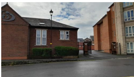
Access to the car park from Darley Lane

Free parking is available at the Church Hall, accessed via Darley Lane. There is usually plenty of space, but Church activities (eg funeral, special mass) may mean it is full. In this case, you should be able to find parking spaces in surrounding streets.