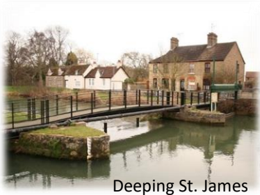
Deeping St. James