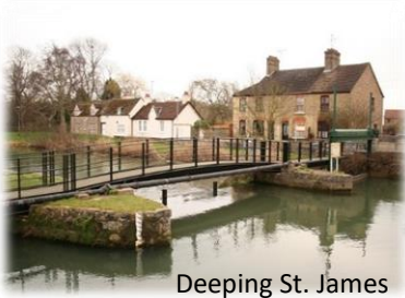
Deeping St. James