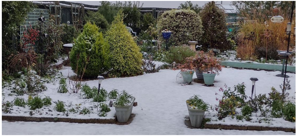
Snow and frost in the Deepings, December 2023