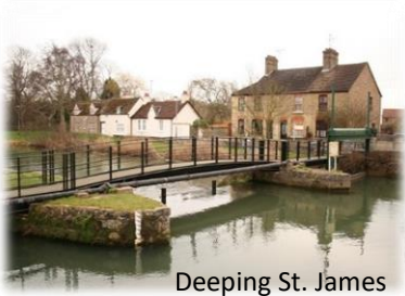
Deeping St. James