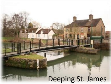
Deeping St. James