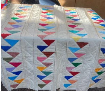
Flying geese quilt