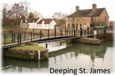
Deeping St. James