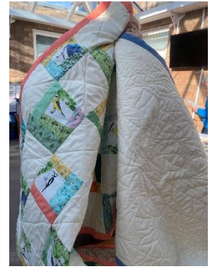
Free motion quilting

Everyone has been mostly busy with individual work this month. The work completed was varied and interesting. Liz kindly showed the group the flying geese technique that she was using to make a baby quilt. See her progress from last month in the photo. Others bought in individual items for the show and tell they had been working on. An example of free motion quilting by Marlene. This is by no means an easy task. Well done ladies.