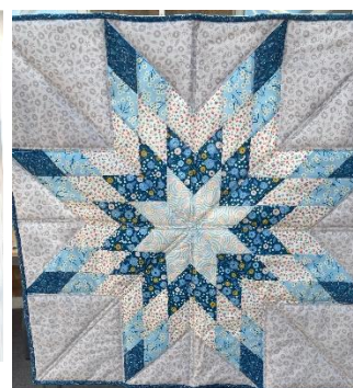
Photo 1 shows the complex cutting of the fabric. In photo 2 we see the star without the backing fabric. Photo 3 illustrates the star with the backing fabric added and photo 4 is the completed quilt with batting, backing fabric added, top stitching done and border added.