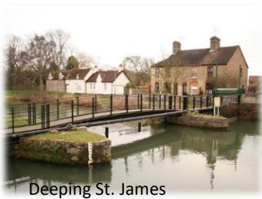
Deeping St. James