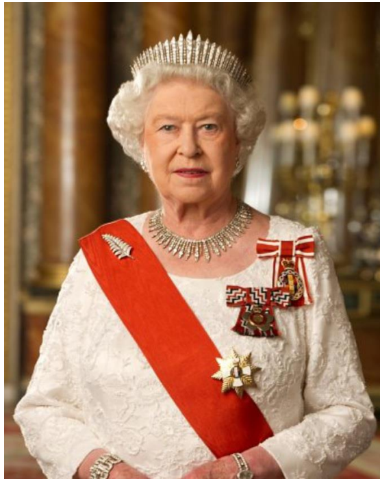
Her Majesty Queen Elizabeth

As members of The Deepings u3a, we pay our respects to Queen Elizabeth for the selfless service she gave throughout her long reign.