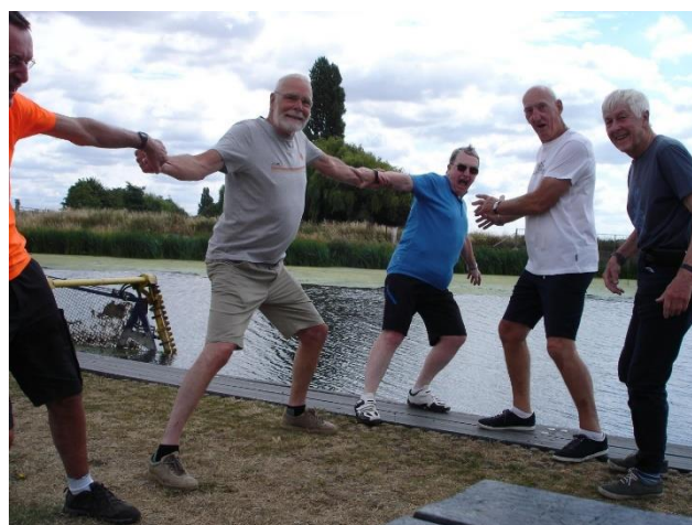
No, don't do it!

We stopped opposite the Water Tower and Bridge Inn where there is a small boat docking site. Here I thought about cooling off but they wouldn't let me go in (see photo).