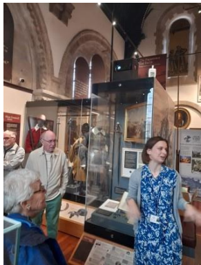
Inside the museum

We had a very enjoyable and interesting visit to the Cromwell Museum and Town Hall. This was followed by a guided tour of Hinchingsbrooke House, which is also the 6th form Centre for the school.