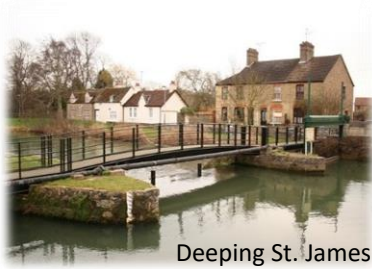
Deeping St. James